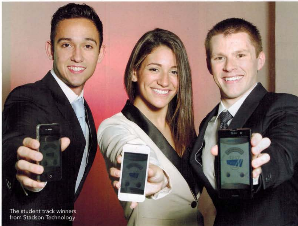
The student track winners from Stadson Technology