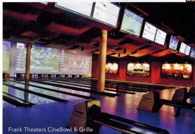
Frank Theaters CineBowl & Grille

Delray Marketplace, features an 85-foot-by-55-foot IMAX screen with incredibly invasive (but in a good way) 3D technology, along with a "Frank Digital Extreme" auditorium—complete with 128 audio streams. Not to be outdone, the Cinemark Palace in Boca upped its own game with the addition of an enormous "Extreme Digital" screen best viewed from its posh upper deck.