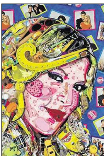
"Tori" is a mosaic portrait in mixed materials by Jason Mecier.

"Reimagined" opens Tuesday from 6 to 8 p.m. at the Delray Beach Center for the Arts in the Cornell Museum of Art. The exhibit showcases work from international artists who used unexpected forms of media in their artwork with the purpose of the piece being "reimagined." The show will be on display through Sept. 6. $5 suggested donation. 51 N Swinton Ave., Delray Beach. 561-243-7922; www.delraycenterforthearts.com