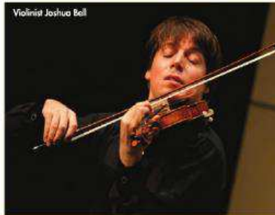
Violinist Joshua Bell

Tickets for the 10th Annual Festival of the Arts BOGA range from $15 to $225 per person and are available at www.festivalboca.com or by calling (866) 571-ARTS (866-571-2757). Multi-event and full Festival packages are also available.