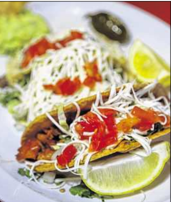
Al Pastor, grilled steak and chicken are tacos served at Tacos al Carbon in Lake Worth — Readers' Choice for best tacos in Palm Beach County.