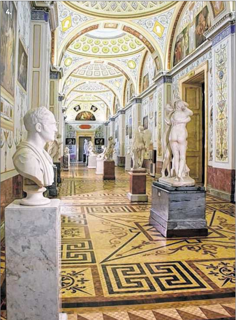
4. Classical sculptures at the State Hermitage Museum in Russia will be among the stars of the movie “Hermitage Revealed” when it’s shown today at the Boca Raton Museum of Art.