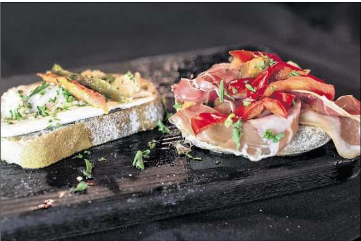
Tapas called montaditos (little sandwich bites) come with fillets of anchovy (left) and Serrano ham (right) on toasted baguettes at Papa's Tapas restaurant.

■ Located in the Esplanade Plaza, 259 NE Second Ave., Delray Beach; 561-266-0599; PapasTapasDelray.com ■ Open Monday through Wednesday from 11 a.m. to 10 p.m., Thursday and Friday from 11 a.m. to 11 p.m., and Saturday from noon to 11 p.m. Closed Sunday.