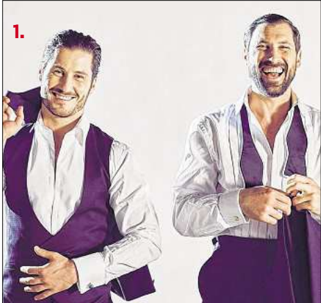
1. Valentin Chmerkovskiy and Maksim Chmerkovskiy perform tonight at the Kravis Center.

Fun things to see and experience around town