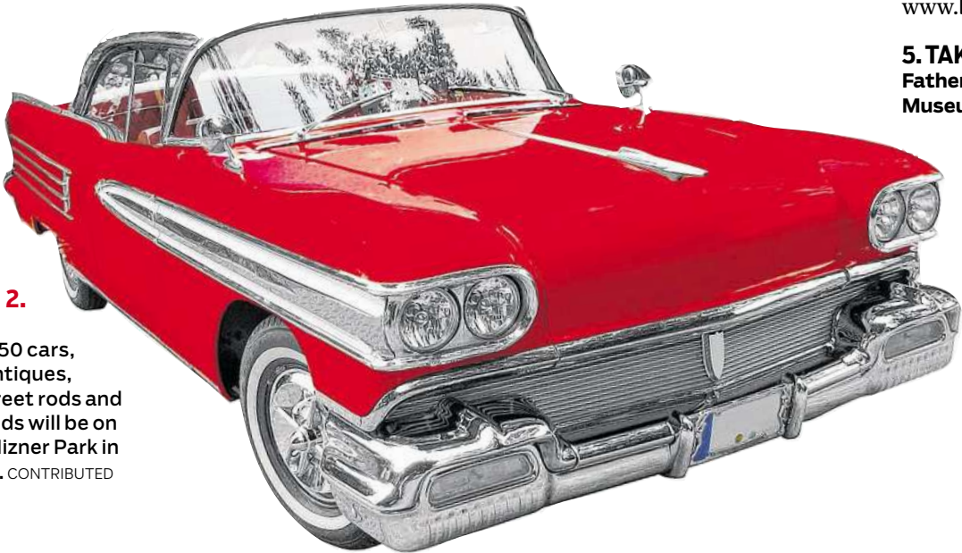
2. More than 150 cars, including antiques, classics, street rods and custom builds will be on display at Mizner Park in Boca Raton.

1. BIG TIME Maks & Val Live on Tour: Our Way, Kravis Center Two of the hottest stars of ABC’s hit show “Dancing with the Stars” will bring to life the show they have dreamed about since childhood, combining an honest and unfiltered narrative of their life story, with world class dancing and creativity. The show goes on at 8 tonight. 701 Okeechobee Blvd., West Palm Beach. Tickets start at $25. Information: www.kravis.org