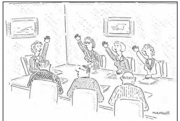
Write a caption for this cartoon, win tickets: See page 10.