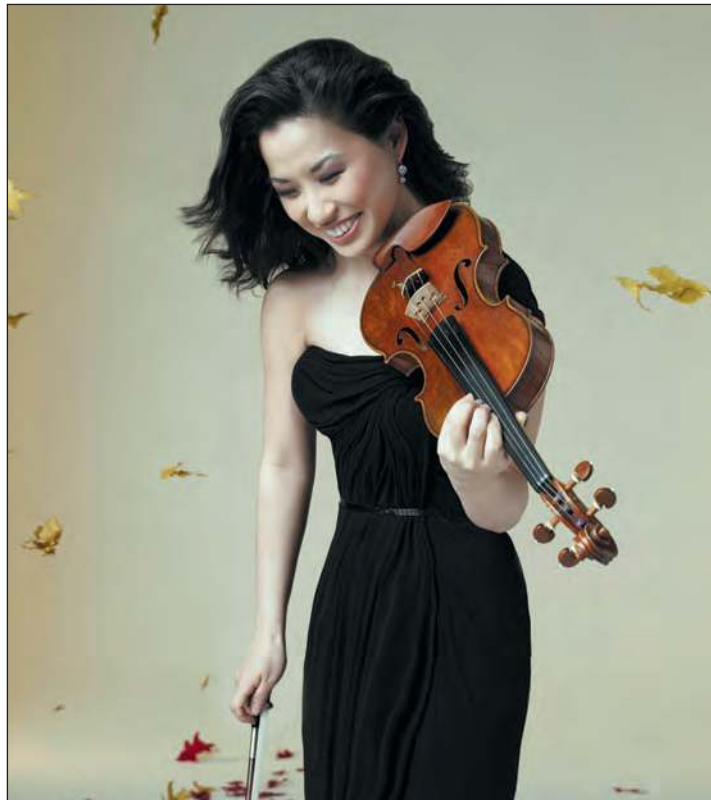
Violinist Sarah Chang will perform on Friday, March 10.