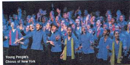
Young People's Chorus of New York