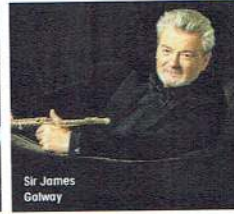
Sir James Galway