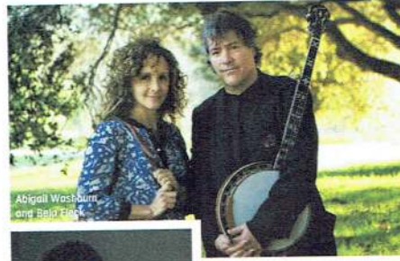
Abigail Washburn and Bela Fleck

For more information, call 866-571-2787 or 561-368-8445, or visit festivalboca.com .