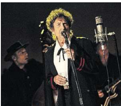
Rock legend Bob Dylan and His Band perform at the Broward Center for Performing Arts Wednesday at 8 p.m.

Get some last minute exercise in at Anchor Park for the 30th annual Turkey Trot 5k run and walk on Saturday at 7:30 a.m. Feel the ocean breeze as you run along the beach to prepare for a food-filled holiday season. Registration fees start at $25. 340 S. Ocean Blvd., Delray Beach. Information: 561-243-7277; www.splitsecondtiming.com