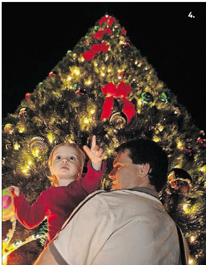
The Annual Holiday Tree Lighting will take place at Mizner Park Amphitheater in Boca Raton Wednesday night to kickoff the holiday season.

Fun things to see and experience around town