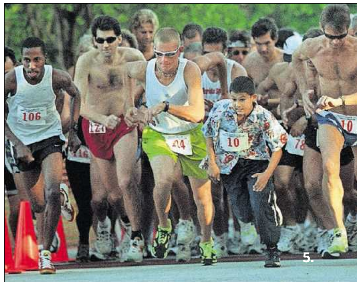
Many will gather in Anchor Park Saturday morning to run or walk in the 30th annual Turkey Trot 5k Run and Walk.