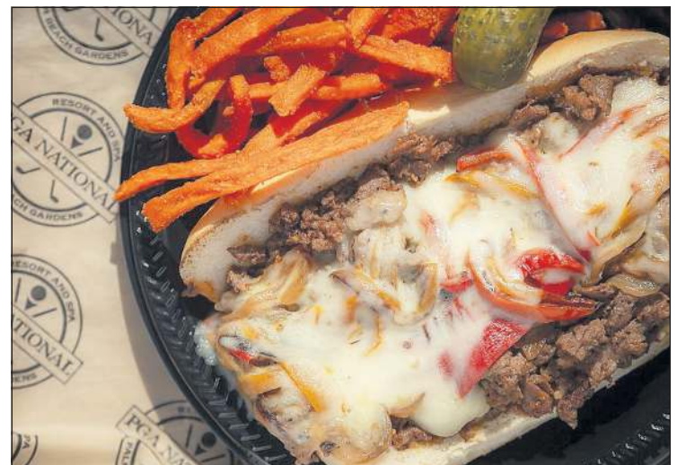
Honda Classic eats: a Philly cheesesteak, made with shaved rib-eye, at the PGA Resort.