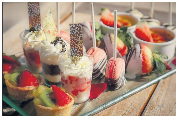
Honda Classic eats: an array of mini desserts from the kitchen at PGA National Resort, where such sweets adorn special buffets.

"Star Wars: A New Hope" with Live Orchestra: Friday at 7:30 p.m. Tickets start at $35. Mizner Park Amphitheater, 590 Plaza Real, Boca Raton. Info: 561-571-5270 or www.festivalboca.org .