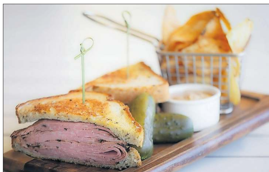
Honda Classic eats: pastrami on rye at the PGA Resort's Bar 91.

poolside favorites, from grilled chicken sandwiches to burgers to wings. (Prices range from $12 to $15.)