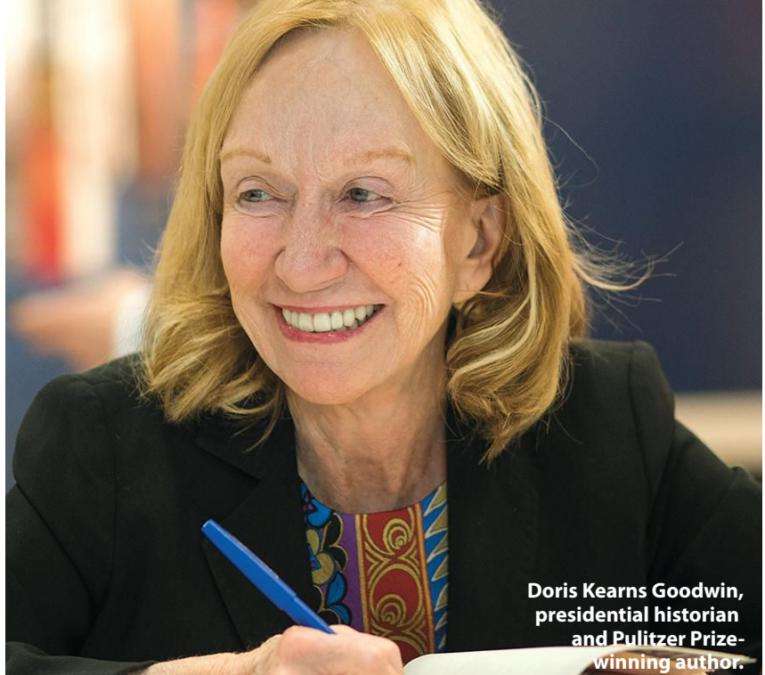
Doris Kearns Goodwin, presidential historian and Pulitzer Prize- winning author.