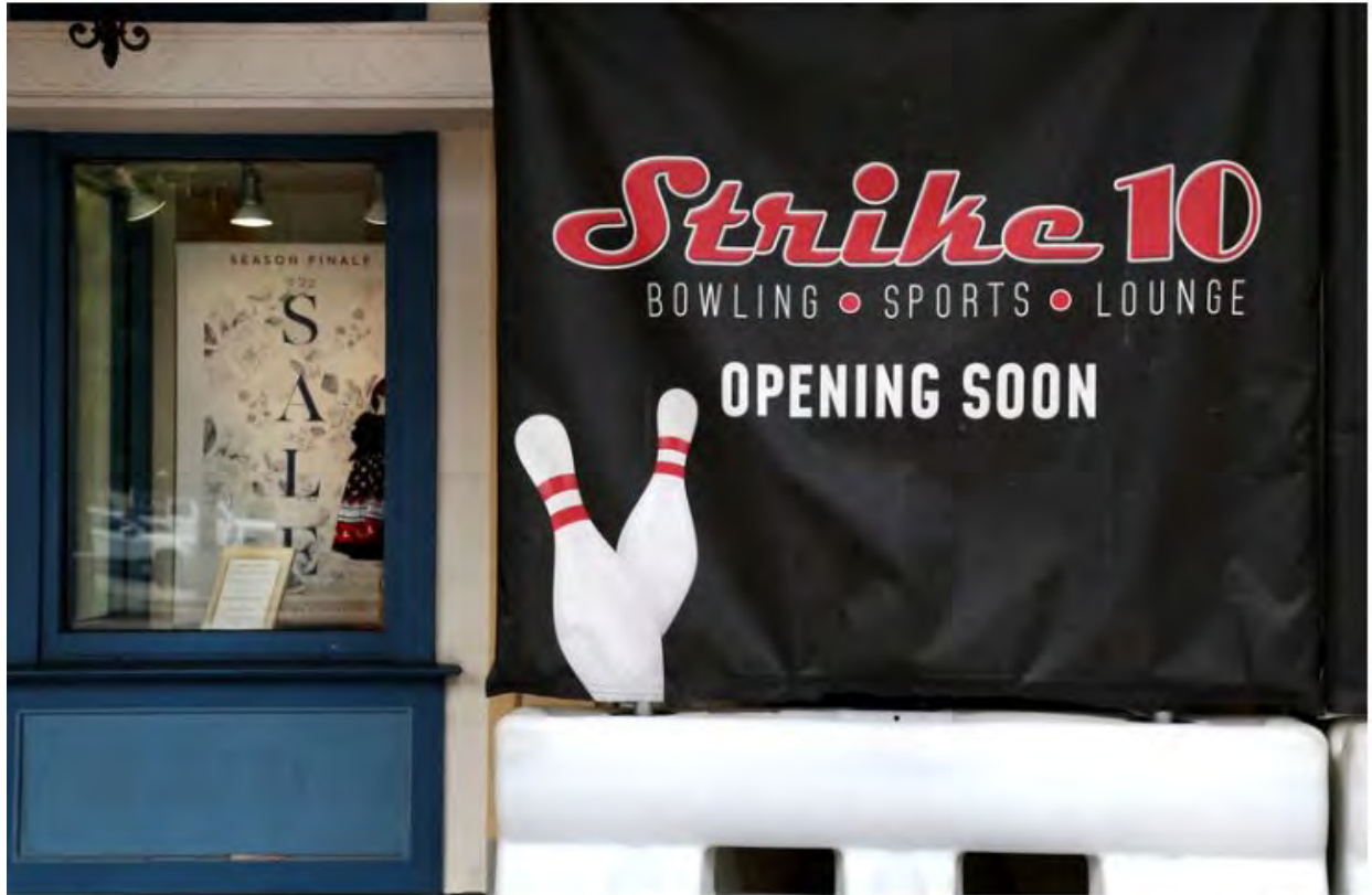
A sign of a new bowling facility coming to Mizner Park in Boca Raton on Thursday January 7, 2021. Mizner Park will have a 30th anniversary on Jan. 11.