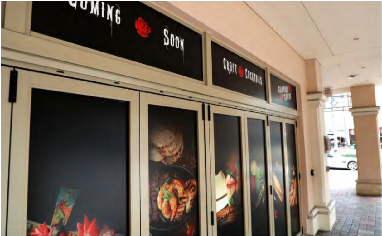
A sign of a new restaurant coming to Mizner Park in Boca Raton on Thursday January 7, 2021. Mizner Park will have a 30th anniversary on Jan. 11.