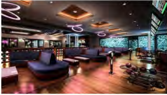
Strike 10 Bowling and Sports Lounge is slated to open in Mizner Park sometime this summer. There is another location at Gulfstream Park in Hallandale Beach.