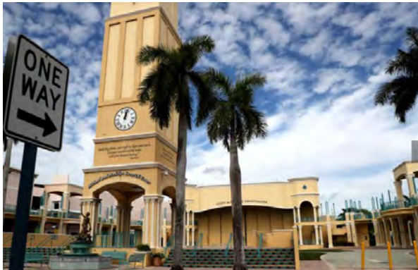
Mizner Park Amphitheater in Boca Raton on Thursday January 7, 2021. Mizner Park will have a 30th anniversary on Jan. 11.