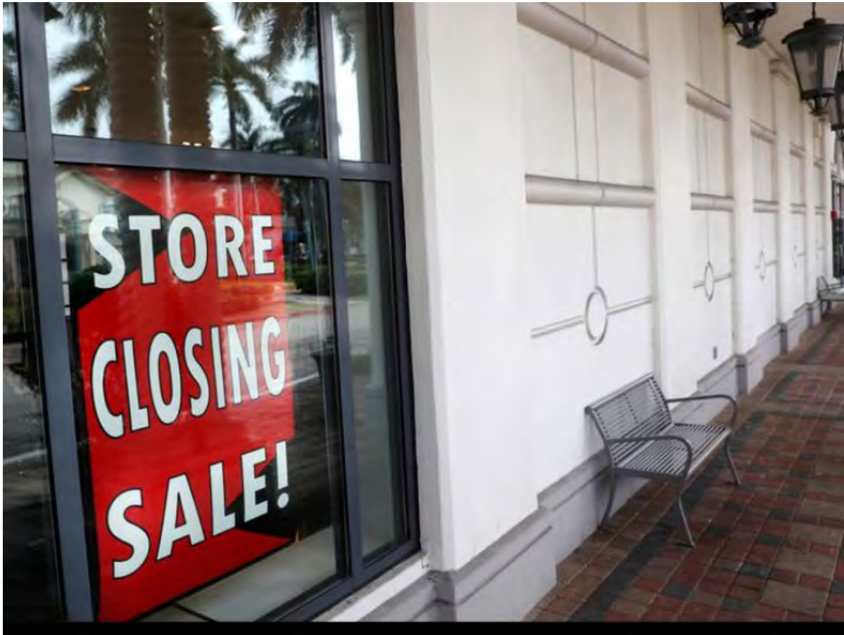
Lord & Taylor store closing at Mizner Park in Boca Raton on Thursday January 7, 2021. Mizner Park will have a 30th anniversary on Jan. 11.