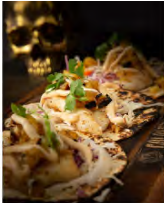
Calaveras Cantina in Jupiter is known for its fresh, contemporary take on Mexican cuisine as well as its Day of the Dead decor. Now the restaurant is planning on bringing that combination to Boca Raton's Mizner Park in 2021.