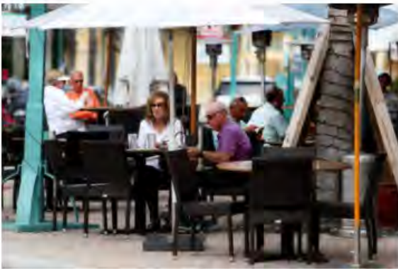
People having lunch at Max's Grille at Mizner Park in Boca Raton on Thursday Jan. 7, 2021. Mizner Park will marks its 30th anniversary on Jan. 11.