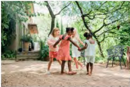
Egg New York is expected to open in Mizner Park in the Spring of 2021. The apparel label bills itself as "...a sophisticated sweet chic affordable luxury children's fashion brand." Egg New York previously had a retail location at the Boca Raton Resort and Club.

clientele and people in Mizner are pretty much the same as we see in Jupiter — some snow birds from the North, but also some locals. We're a place that you can have families in for dinner and then at a certain time it turns into a bar party atmosphere."