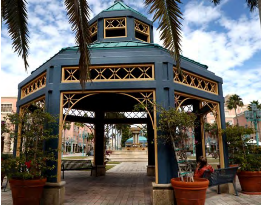
The gazebo at Mizner Park in Boca Raton on Thursday January 7, 2021. Mizner Park will have a 30th anniversary on Jan. 11.