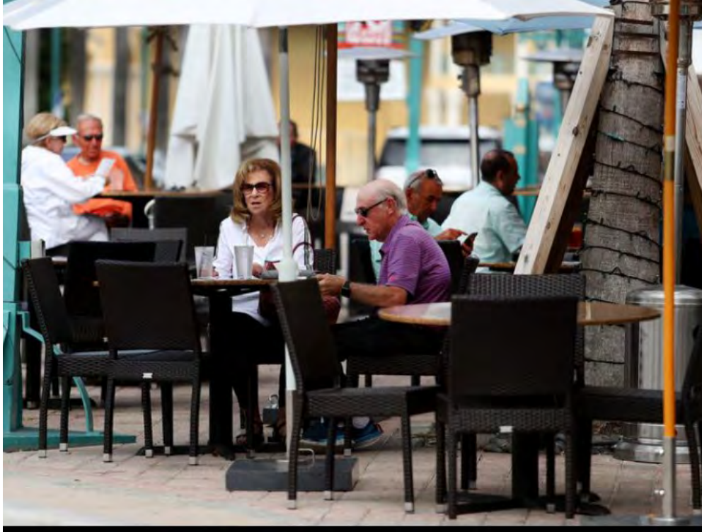
People having lunch at Max's Grille at Mizner Park in Boca Raton on Thursday January 7, 2021. Mizner Park will have a 30th anniversary on Jan. 11.