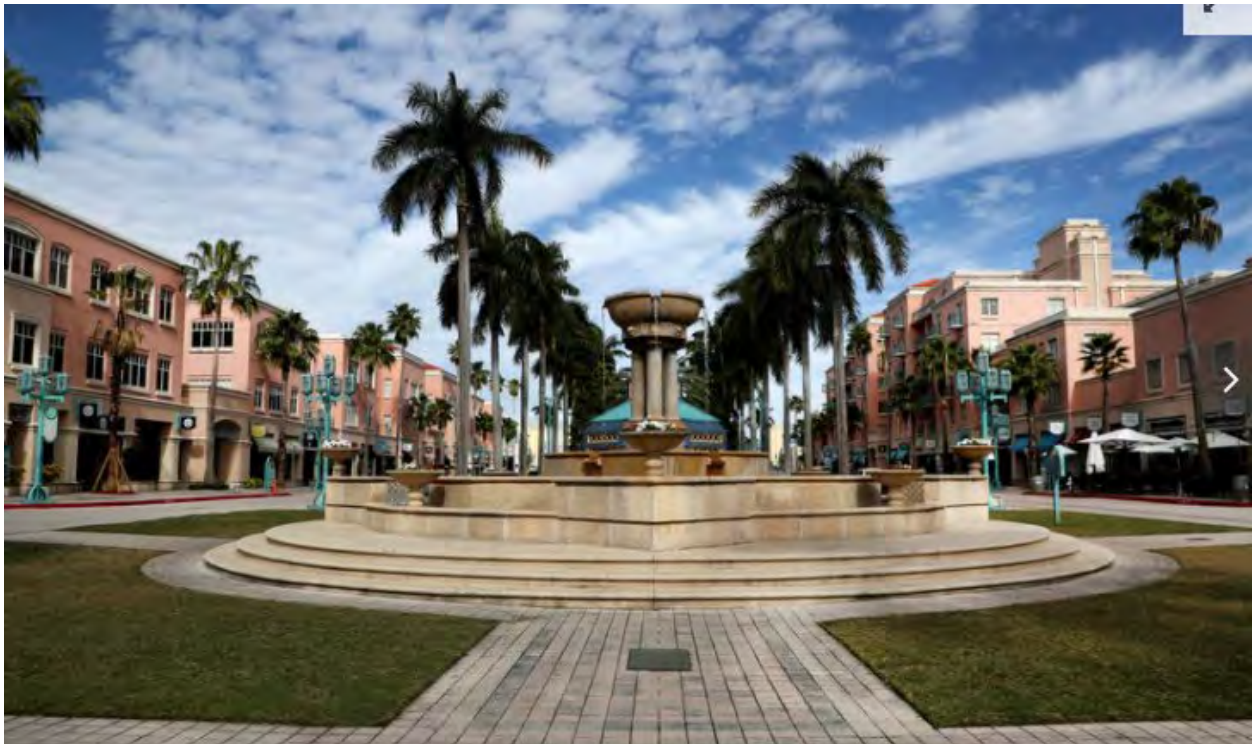
Mizner park in Boca Raton

SOUTH FLORIDA SUN SENTINEL | JAN 08, 2021 AT 1:19 PM