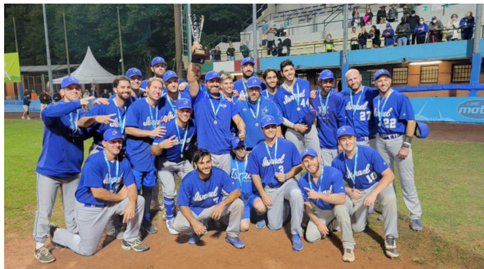
Team Israel will compete in the upcoming World Baseball Classic (WBC) in Miami, March 12-15.

Korea as the underdogs and before anyone else played in the WBC, we were 2-0, having defeated Korea in 10 innings and 12 hours later, Taiwan. We were on top of the world and enjoying every minute of it. We had the next day off and then played the Dutch team for the honor of being the first teams to fly to Tokyo (we had both qualified) and we defeated them as well, with their five major league shortstops all over the field. In the first game in Tokyo, we defeated Cuba (ranked #5 in the world) of all teams. After the 4-1 victory over Cuba, the players celebrated Purim with a reading of the Megillah in the dugout. We were riding high and looking forward to getting to Los Angeles, till we fell flat against Holland and Japan and had to settle for 6th place. Prior