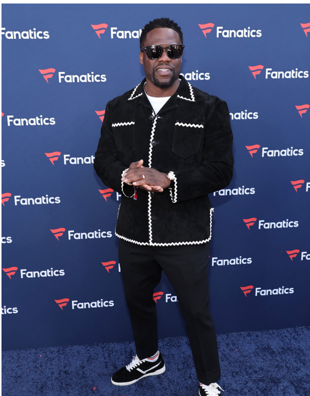
Comedian Kevin Hart will bring his global 2023 Reality Check Tour to Hard Rock Live on June 3. Tickets go on sale Friday.

Future laughs: Actor and comedy star Kevin Hart has expanded his global 2023 Reality Check Tour to include a stop at Hard Rock Live in Hollywood on June 3. After a presale, tickets will go on sale at 10 a.m. Friday at KevinHartNation.com. ... Andrew Santino