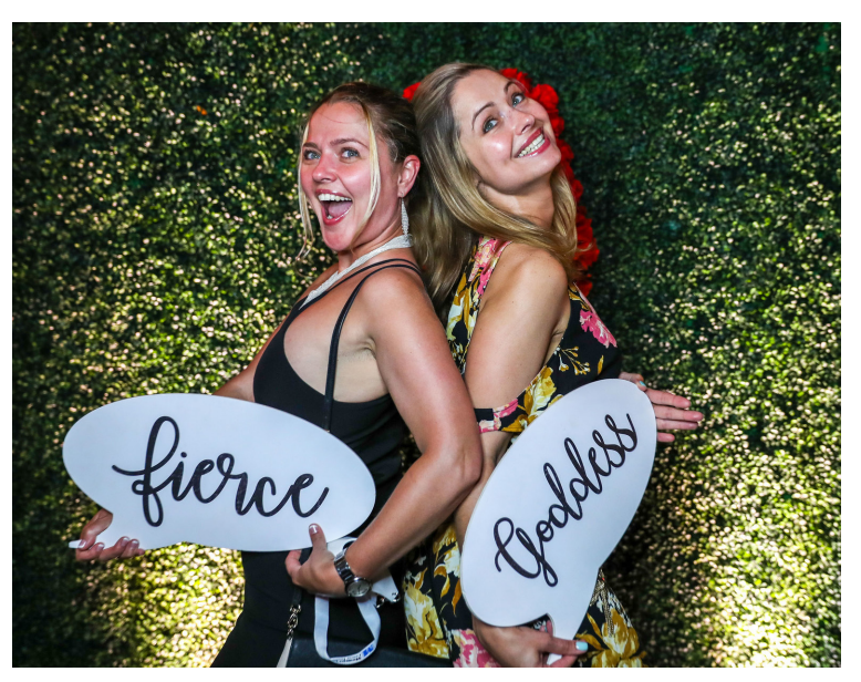
Returning to downtown Fort Lauderdale on Friday, the Las Olas Wine & Food Festival is about food and wine, plus attitude and Instagram moments.