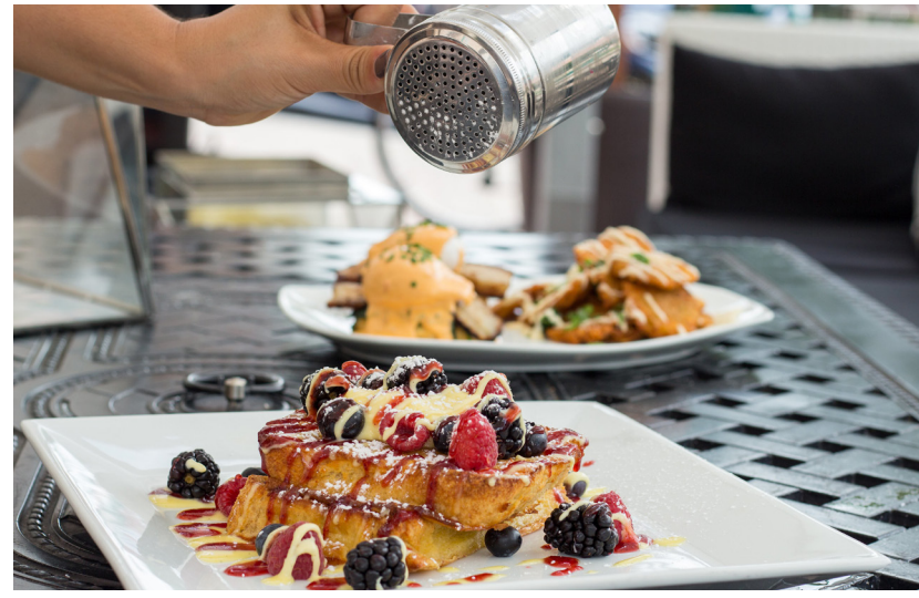
The Creme Brulee French Toast is part of the regular brunch offering, which will be available on Mother's Day along with a special menu at Max's Grille in Boca Raton's Mizner Park. MAX'S GRILLE