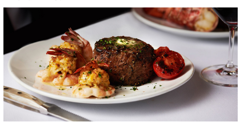
The Filet Mignon with Crab-Stuffed Shrimp Scampi, one of the special dishes for Mother's Day at Fleming's Prime Steakhouse & Wine Bar. FLEMING'S