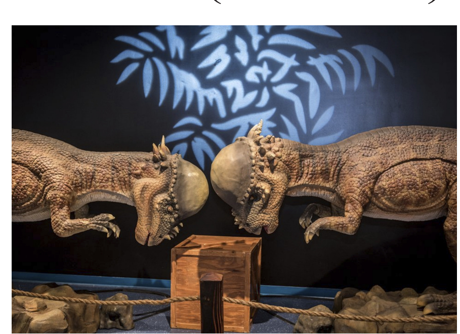
The Mesozoic Era will soon come to life at the Museum of Discovery and Science in downtown Fort Lauderdale with the "Expedition: Dinosaur" exhibit.