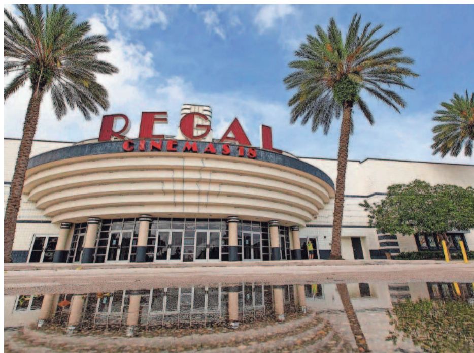
Regal Royal Palm Beach & RPX is offering Regal Unlimited passes that start at $18.99 a month.

Season passes also include unlimited visits, free parking in the regular lot, a 10% discount on food and merchandise, a 20% discount on cabana rentals and free admission to other parks throughout the country.