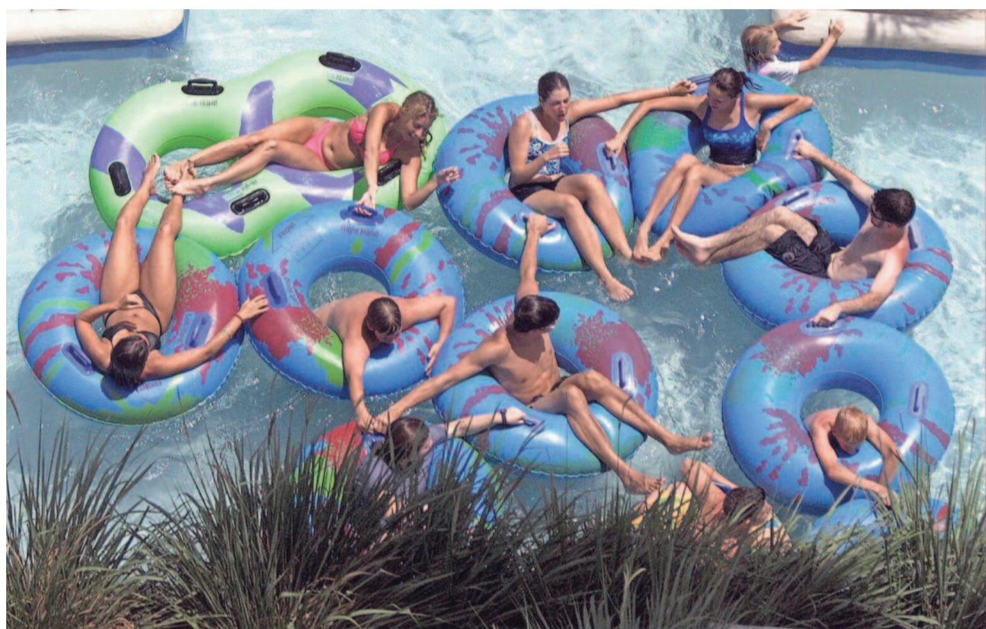
Youngsters tube down the Lazy River at the Rapids Water Park in Riviera Beach. The Lazy River circles the park and is one of its most popular attractions.