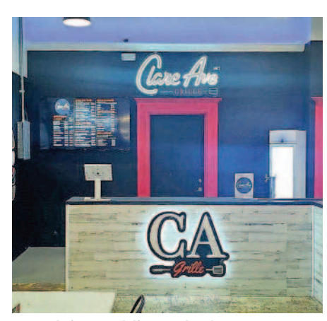
Grandview Public Market's newest vendor Clare Ave Grill officially opened on July 4.