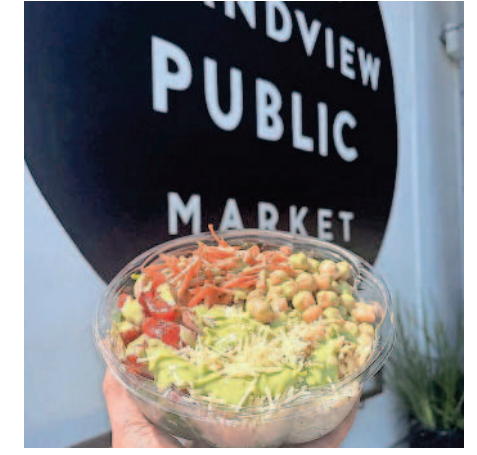
This bowl at Josey's Salads & Smoothies is great way to get happy and healthy.

a stewed meat-style filling and crunchytaco concept.