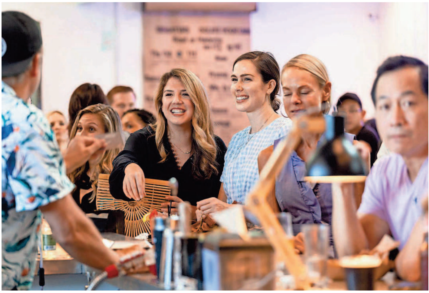
The District Bar is centrally located at Grandview Public Market and the perfect spot to grab a drink as well as mix and mingle. CAPEHART

Ricky said that Bonitas is based more on a Mexico City-type taco that features