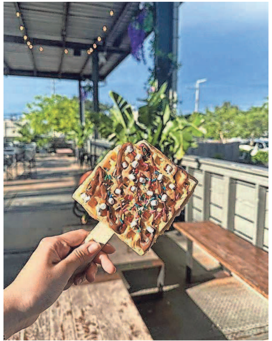
The yuca waffles at Nativus can be transformed in "waffle bombs" and combined with sauces like Nutella, guava, dulce de leche and more.