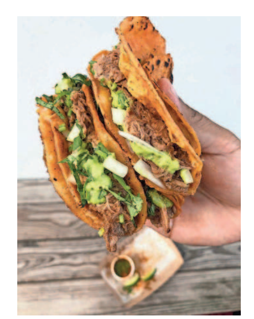
Pure yum awaits at Bonitas, located at Grandview Public Market BONITAS