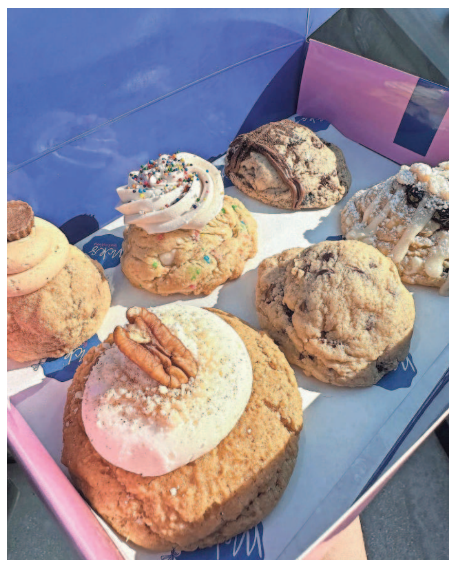
With taste temptations including classic chocolate chip cookies, peanut butter cheesecake, apple crumble, salty caramel pistachio and many more, Mcks' Bakeshop at Grandview Public Market is known for creating sophisticated flavor profiles. MCKS' BAKESHOP