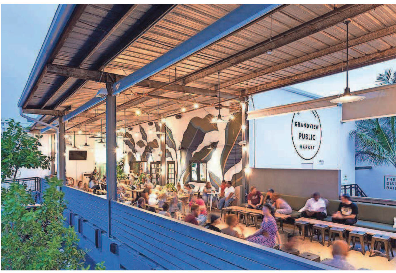
Grandview Public Market has several new restaurants, a bar and even a pop-up bakery that have opened the last few months. JEFF HERRON

Though the yuca waffles can be eaten plain or with cheese, customers often choose to take them to the next level adding sauces such as Nutella, guava and dulce de leche and/or toppings in-