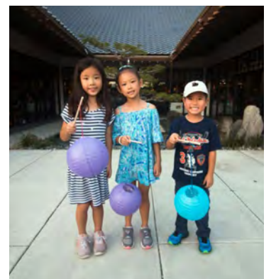
Guiding light lanterns will be for sale during Obon Weekend at Morikami Museum. Take them home to light in memory of lost loved ones.

Since it opened in 1977, the museum has celebrated Obon, which commonly takes place in Japan over several days in August. Through the years, the traditional one-day festival has grown into a weekend-long celebration featuring taiko drummers, crafts, dance, garden strolls and the popular